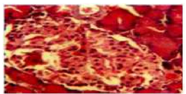
Figure No.2: Diabetic pancreas H and E Staining (40X) Section shows normal pancreas with insulin in pancreas

Ratna Kumari Y. et al. / Asian Journal of Phytomedicine and Clinical Research. 4(4), 2016, 178 - 186.