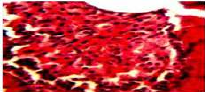
Figure No.5: Pancreas treated with test drug 1 (piperine100mg/kg) H and E Staining (40X) Section shows increase in granulated and normal beta cells

Available online: www.uptodateresearchpublication.com October - December