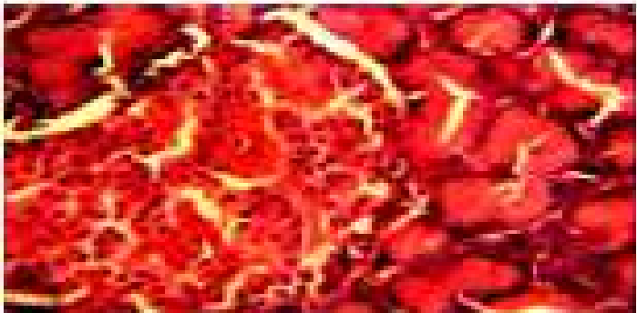
Figure No.3: Pancreas treated with standard (Glibenclamide10mg/kg) H and E Staining (40X) Section shows pancreas with mild damage

Figure No.2: Diabetic pancreas H and E Staining (40X) Section shows normal pancreas with insulin in pancreas